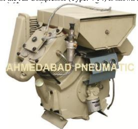
Fig. 3: Air Compressor (Type VT4).

System under study is Industrial Air Compressor (Type: VT4). In order to investigate the applicability of proposed compressor, the image of the Air Compressor (Type: VT4) is shown in the figure 3.